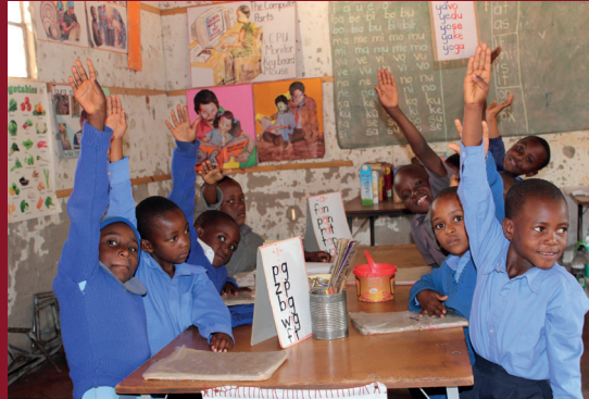
St. Peter's Primary School, Mbare-Harare

Unlocking the future of the young through holistic education