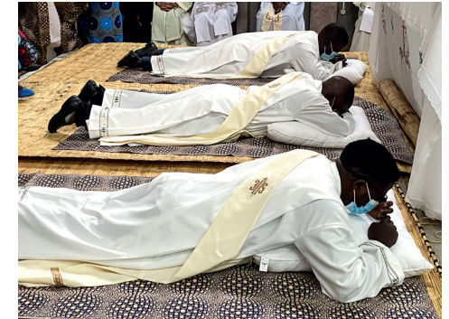
2021 Jesuit Priestly Ordination, Lifidzi - Mozambique